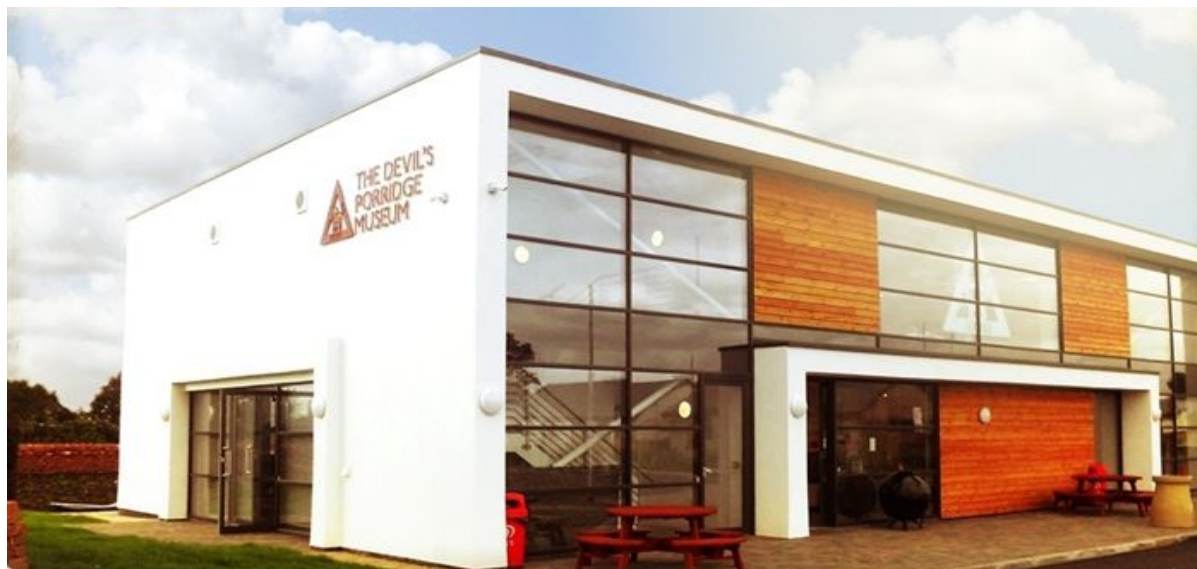
The Devil's Porridge Museum, Eastriggs, Dumfries and Galloway

As part of the We Will Remember commemorations a visit has been arranged to The Devil's Porridge Museum at Eastriggs, near Annan.